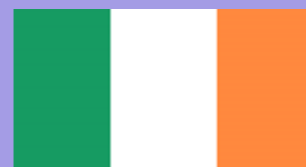
The C&C Group