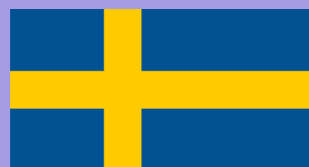
Molson Coors UK